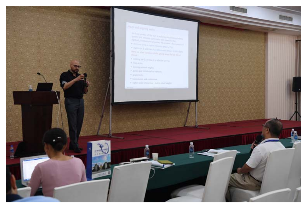
Figure 14: ccdc2019_Distinguished Lecture Session _Professor Yang Shi Caption: Professor Yang Shi delivering his distinguished lecture