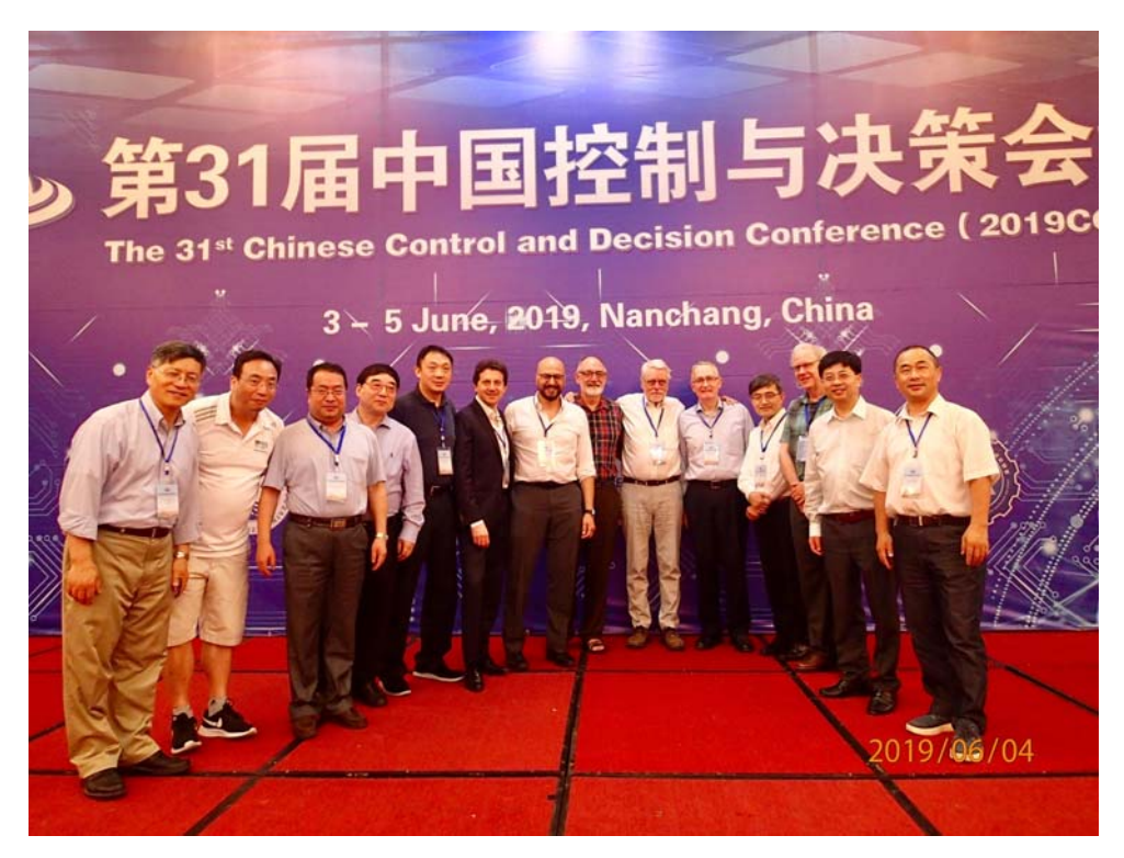
Figure 26: ccdc2019_ Registration Caption: CCDC 2019 delegates