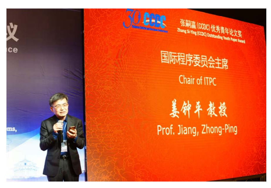
Figures 12: ccdc18_ Award Ceremony

Caption: The 2018 CCDC Award Committee assessing the oral presentations of the five finalists