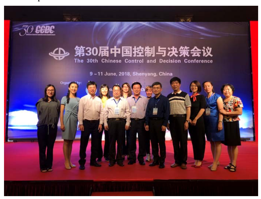
Figures 14: ccdc18_ Award Ceremony