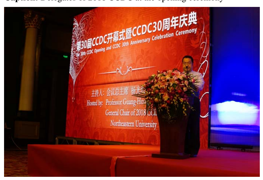
Figure 2: ccdc18_ The 30th CCDC Opening and CCDC 30th Anniversary Celebration Ceremony

Caption: Delegates of 2018 CCDC at the opening ceremony