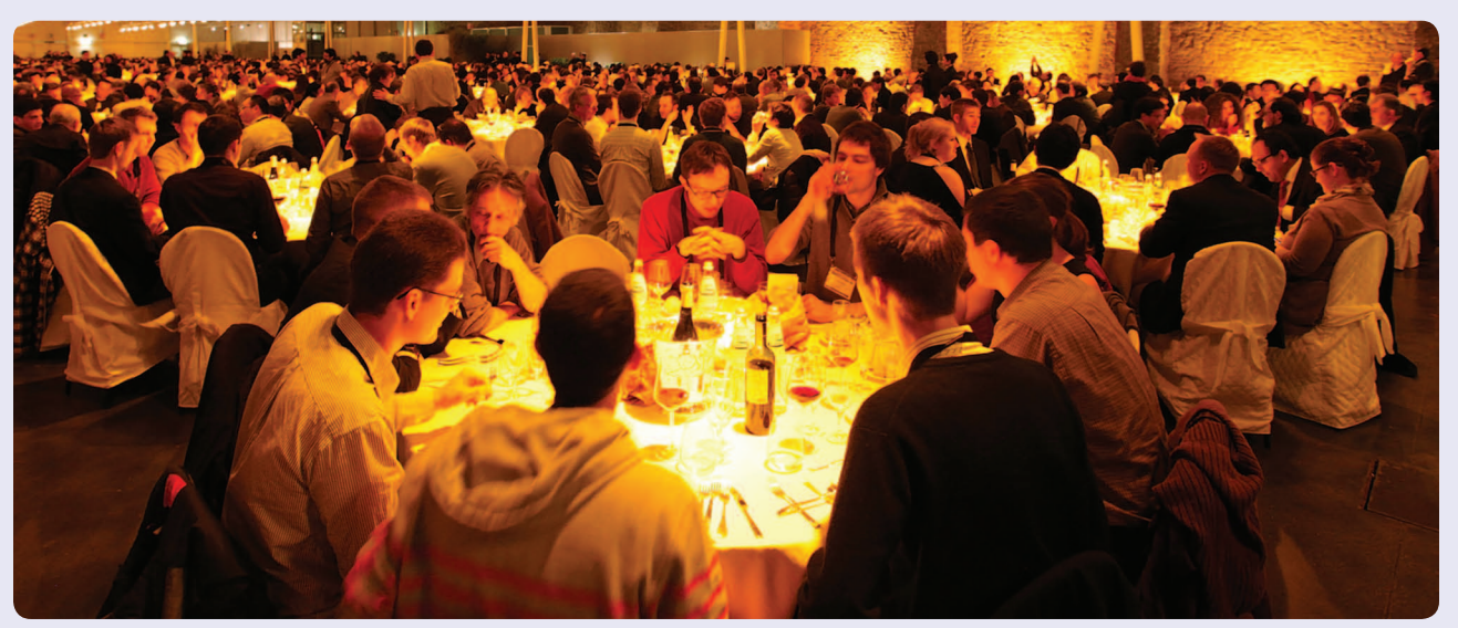
The banquet, which took place at Palazzo Cavaniglia, Fortezza da Basso, was attended by a record number of conference participants (over 1540).