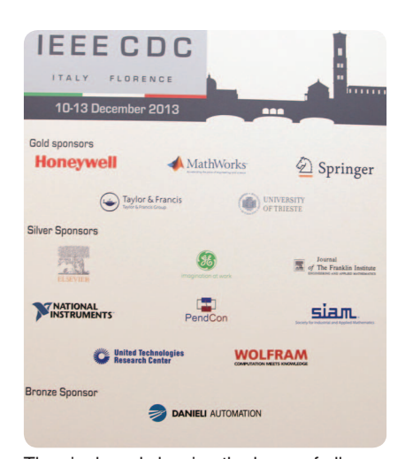
The signboard showing the logos of all conference sponsors.

Several social events were scheduled during the conference: Opening Reception, Newcomers Reception, Women in Control Luncheon, CSS Awards Reception, Conference Banquet, and Closing Reception. The receptions took place in the Passi Perduti Ballroom. The conference banquet, which was attended by a record 1540 conference registrants and their guests, was held at Palazzo Cavaniglia, Fortezza da Basso.