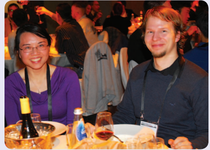
Conference participants at the banquet.