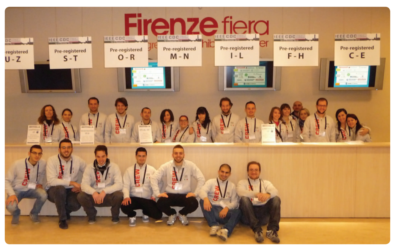
Members of the registration team ready to go the day before the conference began.

Common Characteristics and Distinguishing Feature"