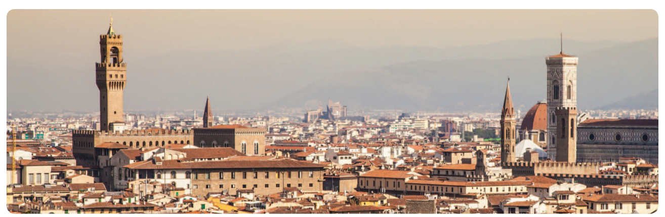
The beautiful city of Florence at sunset with a view of the Palazzo Vecchio and the Duomo.