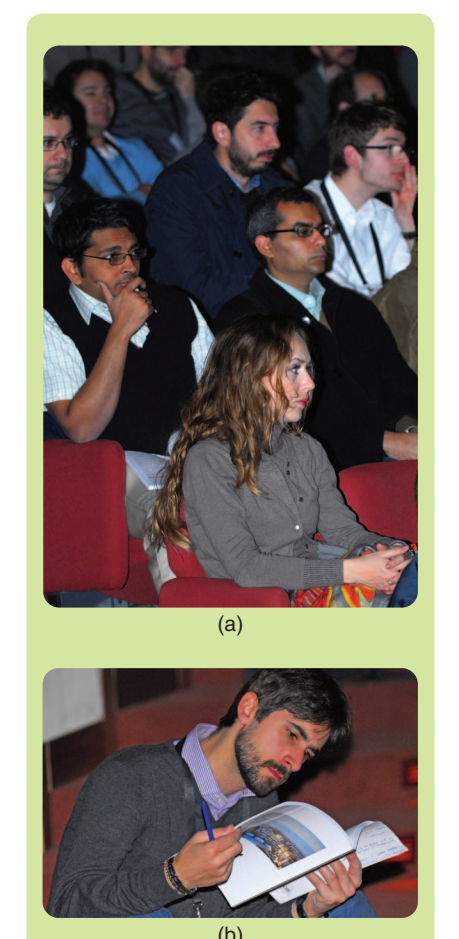
Conference participants (a) during one of the plenary lectures and (b) browsing through the technical program of the conference.

on Decision and Control was chosen because we believed that modern control theory (still in its infancy) would eventually have widespread applications in nontraditional control ..."