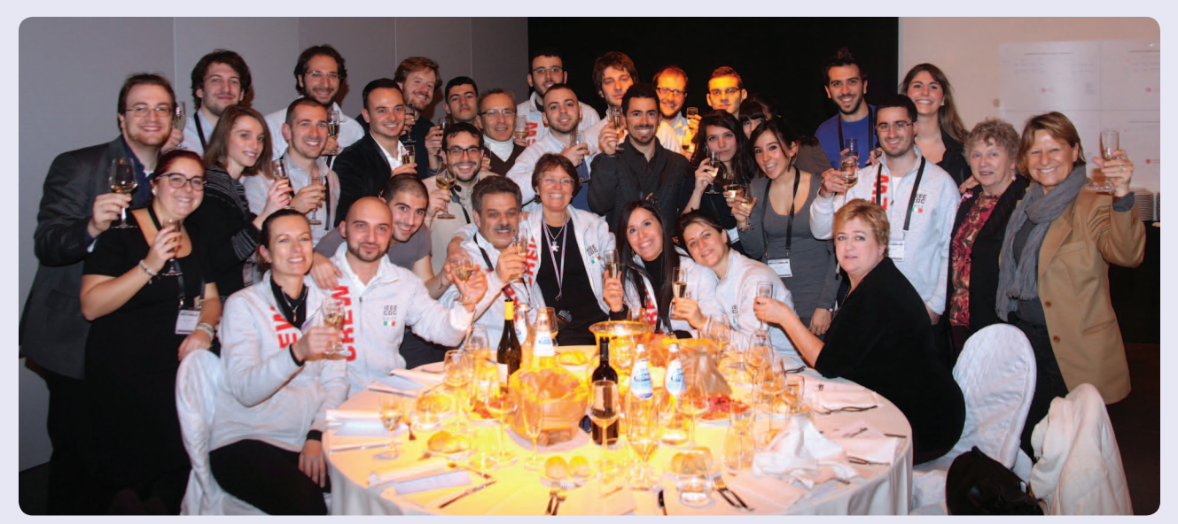
Several conference organizers and volunteers experiencing a joyful moment.