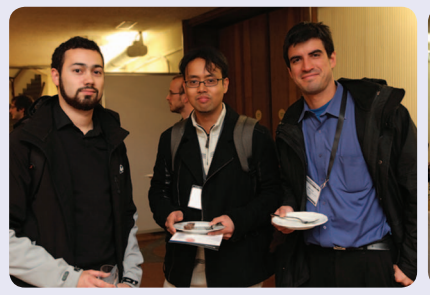
Conference attendees at the farewell reception.