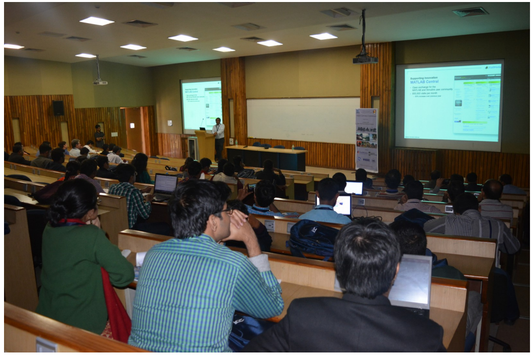
Figure 9. Presentation in a regular session