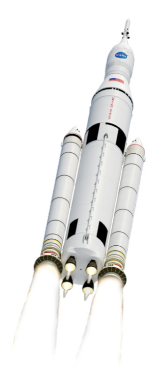
NASA's Space Launch System Block I Vehicle

As with all large launch vehicles, the SLS control system must balance the competing needs of maximizing performance while maintaining robustness to limitations in preflight models. With its high thrust, large size, and multistructural load paths, SLS exhibits a high degree of structural flexion with nonplanar characteristics. Control commands are allocated to each of its six engines that are gimbaled along orthogonal axes by hydraulic thrust vector control actuators, leading to a control resource management challenge. The massive core propellant tanks and long-moment-arm upper-stage tanks have lightly damped lateral sloshing modes. The SLS trajectories are highly optimized to maximize payload-to-orbit performance. These challenges restrict the available design space for the flight control system and leave very little margin to share among the disciplines and subsystems.