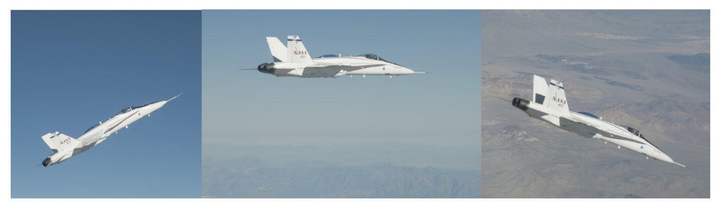
Photographs depicting the trajectory flown repeatedly by NASA's F/A-18 while testing the SLS AAC (2013, through a partnership among the NASA organizations MSFC, AFRC, NESC, and STMD-GCT)

A majority of the components of the SLS FCS for vehicle ascent were flown on Ares I-X: sensor blending, PID, bending filters, DCA, and parameter identification maneuvers. A series of F/A-18 research flights was used to test SLS prototype software, including the previously untested AAC and OCA components. Except for disabling the DCA, the control parameters for this test were identical to the SLS design set. The fighter aircraft completed a series of trajectories during multiple sorties with the SLS FCS enabled while matching the aircraft's pitch rate to that of the SLS and matching attitude errors for various nominal and extreme SLS scenarios through the use of a nonlinear dynamic inversion controller. The emphasis of the 100+ SLS-like trajectories was on fully verifying and developing confidence in the adaptive augmenting control algorithm in preparation for the first unmanned launch of SLS.