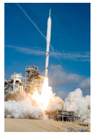
Ares I-X flight test launch (October 28, 2009)