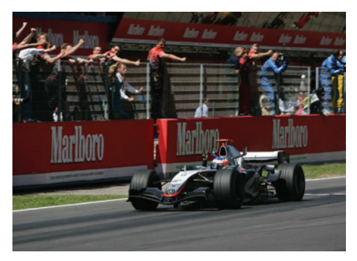
Kimi Raikkonen crosses the finish line to take victory for McLaren in the first car to race the inerter.