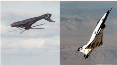
Left: The RAH-66 was the first helicopter that was capable of backflips. Right: X-31 demonstrating high angle of attack maneuver.

NASA's Dryden Flight Research Center, Draper Laboratory, The Boeing Company, and Airbus were inducted into the Space Technology Hall of Fame in 2010 for the development of digital fly-by-wire technology that makes modern aircraft easier and safer to operate.