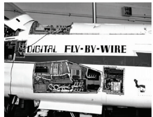
NASA used an F-8C for its digital fly-by-wire program, the first DFBW aircraft to operate without a mechanical backup system. This photo shows the Apollo hardware jammed into the F-8C. The computer is partially visible in the avionics bay.

Contributor: Christian Philippe, European Space Agency, Netherlands