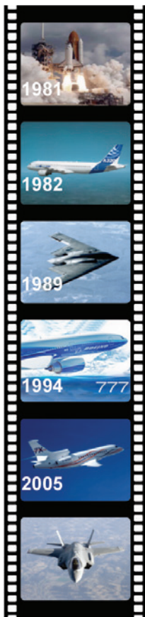
From top to bottom: Space Shuttle, Airbus A320, B-2 Stealth Bomber, Boeing 777, Dassault Falcon 7X, and Joint Strike Fighter X35

Digital fly-by-wire (DFBW) is one of many success stories where technology developed under the U.S. space program has proven beneficial in other areas. Based in part on a recommendation from Neil Armstrong, who was directly familiar with the Apollo Guidance Computer through his historic lunar landing, NASA's Dryden Flight Research Center chose to work with Draper Laboratory to adapt the concept for aircraft, beginning with experimentation on a U.S. Navy F-8 Crusader in 1972.