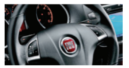
Shift buttons on the steering wheel of a FIAT Bravo

The automated manual transmission (AMT) is an intermediate technological solution between the manual transmission used in Europe and Latin America and the automated transmission popular in North America, Australia, and parts of Asia. The driver, instead of using a gear stick and clutch pedal to shift gears, presses an upshift or downshift button and the system automatically disengages the clutch pedal, shifts the gear, and engages the clutch again while modulating the throttle; the driver can also choose a fully automated mode. AMT is an add-on solution on classical manual transmission systems, with control technology helping to guarantee performance and ease of use.