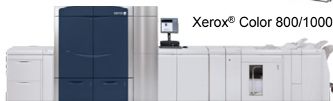
Xerox® Color 800/1000