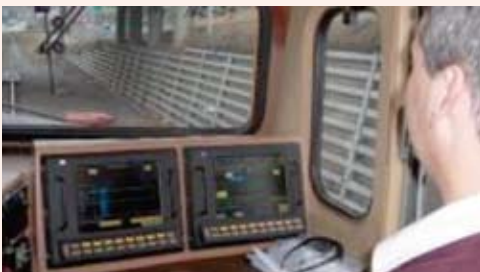
Trip Optimizer is a product of GE Transportation, Erie, Pennsylvania.

For each Evolution locomotive on which it is used, Trip Optimizer can reduce fuel consumption by 32,000 gallons, cut CO 2 emissions by more than 365 tons, and cut NOx emissions by 3.7 tons per locomotive per year. If Trip Optimizer is deployed on the approximately 10,000 similar locomotives in service in North America, these savings equate to taking a million passenger cars off the road for a year.