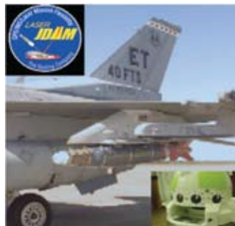
Laser guided MK - 82 scores direct hit against a moving target during tests at Eglin AFB