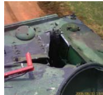
Affordable hit-to-kill accuracy minimizes collateral damage