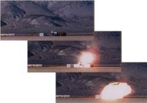
Photo sequence showing JDAM test against mobile ground targets

Affordability and weapon accuracy (including collateral damage minimization) are among the primary objectives for the JDAM. The new robust adaptive control algorithms provide accurate control of the weapon, accommodating warhead aerodynamic uncertainties and off-nominal mass properties. Without control modifications, these uncertainties can significantly degrade weapon accuracy.