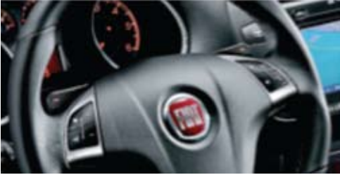
Shift buttons on the steering wheel of a FIAT Bravo

The automated manual transmission (AMT) is an intermediate technological solution between the manual transmission used in Europe and Latin America and the automated transmission popular in North America, Australia, and parts of Asia. The driver, instead of using a gear shift and clutch to change gears, presses a + or - button and the system automatically disengages the clutch, changes the gear, and engages the clutch again while modulating the throttle; the driver can also choose a fully automated mode. AMT is an add-on solution on classical manual transmission systems, with control technology helping to guarantee performance and ease of use.