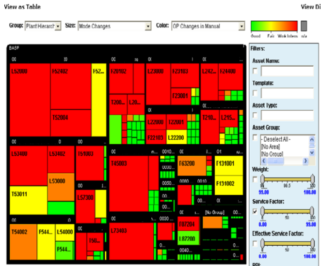
Color-coded graphics for plantwide CPM. The tiled rectangles refer to plant subsystems (e.g., units); the size of each rectangle can be proportional to energy consumption, alarm counts, or a user-defined property. Colors indicate the current assessment of each subsystem.